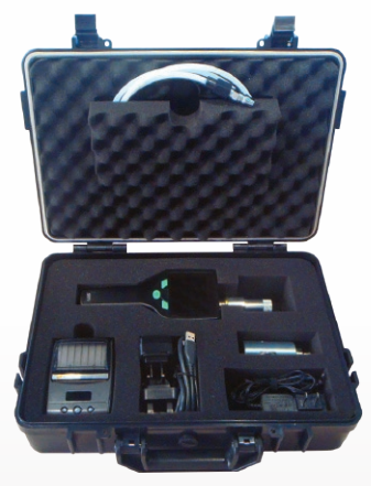
Transport case: compact + safe