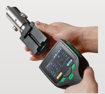
Easy sensor module change through slide-in module with auto-connect