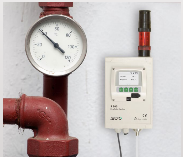
optional alarm unit mounted on the housing